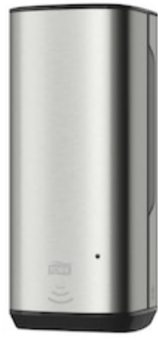
Tork Soap-Sanit Disp – Int Sens, SS 460009