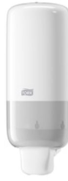
Tork Skincare Dispenser White 561500