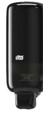
Tork Skincare Dispenser Black 561508