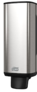
Tork Skincare Dispenser 460010