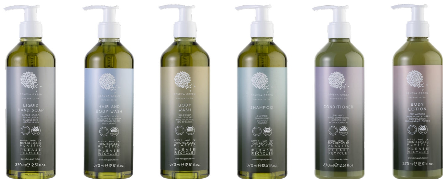
LIQUID HAND SOAP 370 ml e 12.51 fl.oz. P350R_LMGR HAIR & BODY WASH 370 ml e 12.51 fl.oz. P350R_MGR BODY WASH 370 ml e 12.51 fl.oz. P350R_BGR SHAMPOO 370 ml e 12.51 fl.oz. P350R_SGR CONDITIONER 370 ml e 12.51 fl.oz. P350R_CGR BODY LOTION 370 ml e 12.51 fl.oz. P350R_BLGR

Non-refillable bottle P350LMGR Refillable bottle With Aloe Vera extract With Green Anise and Melissa organic extracts