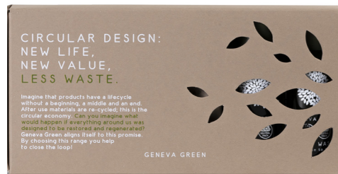
SMALL AMENITIES PAPER BOX 16,4 x 8 x 2,7 cm

CAMPSGR Contains 4 x P30 bottles - 30 ml e 1.01 fl.oz. and 1 x B0915GR soap - 15 g e Net wt. 0.52 oz.