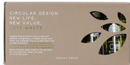
BIG AMENITIES PAPER BOX 17 x 8,5 x 3,2 cm

CAMPSGR Contains 4 x P30 bottles - 30 ml e 1.01 fl.oz. and 1 x B0915GR soap - 15 g e Net wt. 0.52 oz.