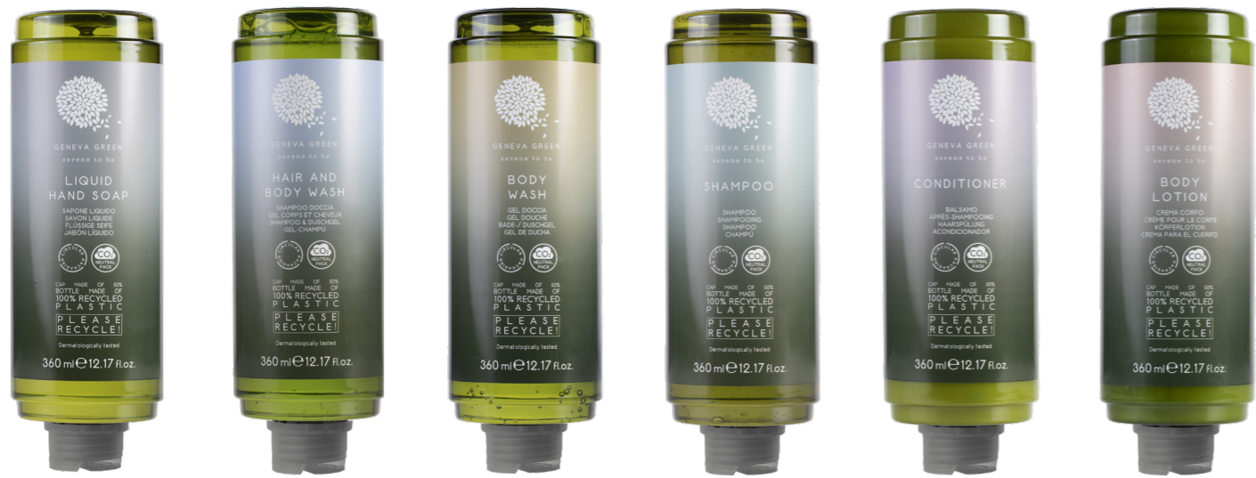
LIQUID HAND SOAP 360 ml e 12.17 fl.oz. PCYR360ILMGR HAIR & BODY WASH 360 ml e 12.17 fl.oz. PCYR360IMGR BODY WASH 360 ml e 12.17 fl.oz. PCYR360IBGR SHAMPOO 360 ml e 12.17 fl.oz. PCYR360ISGR CONDITIONER 360 ml e 12.17 fl.oz. PCYR360ICGR BODY LOTION 360 ml e 12.17 fl.oz. PCYR360IBLGR

With Aloe Vera extract With Green Anise and Melissa organic extracts